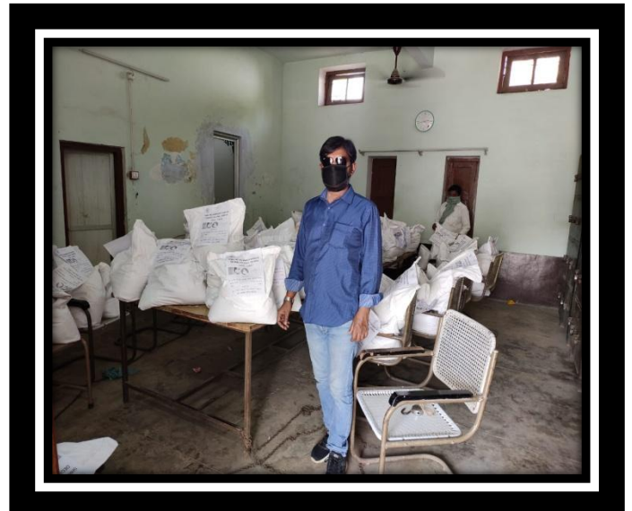
Some glimpse of our attempt to help others at extremely hard conditions